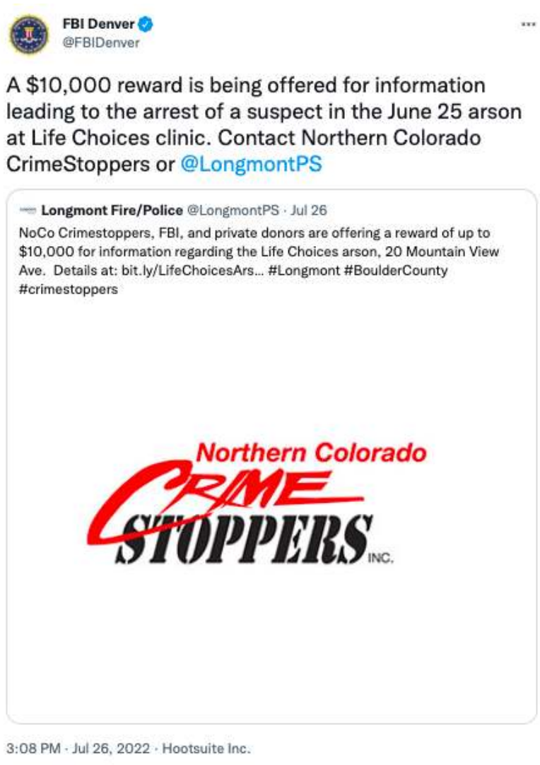
(FBI Denver, Twitter , 7/26/22)

On July 26, 2022, The FBI Field Office In Denver, Colorado Tweeted That There Is A $10,000 Reward For Information Leading To The Arrest Of A Suspect In This Crime. (FBI Denver, Twitter , 7/26/22)