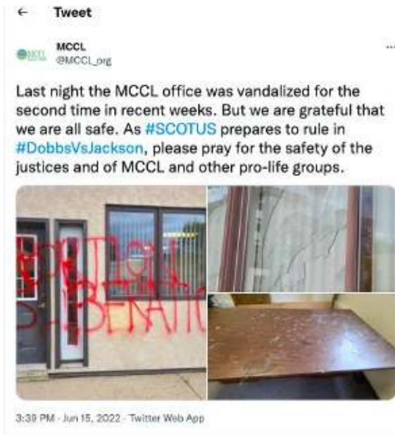
(MCCL, Twitter , 6/15/22)

The Vandalism Included Broken Windows And Graffiti. “Last night the MCCL [Minnesota Citizens Concerned for Life] office was vandalized, including graffiti and some broken windows. It's the second time we have been targeted in recent weeks. But we are grateful that we are all safe,’ read a post from the organization's Facebook page.” (Nick Longworth, “Minnesota Pro-Life Organization Vandalized, Perpetrator Takes Credit Online,” Fox-Minneapolis , 6/17/22)